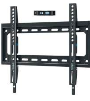
LCD TV Mount Bracket